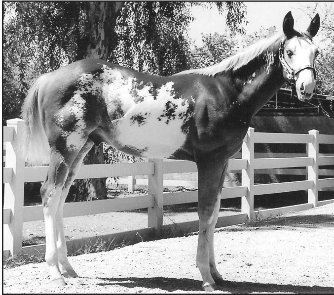
Being offered for sale is Supreme Charisma, a full brother to The Gift Of Midas (one of the Marx' studs) from the very popular Red Charisma bloodline.