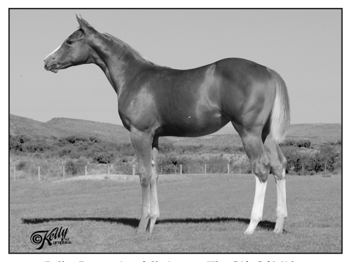
Belles Beauty is a full sister to The Gift Of Midas.

Foals produced at Mountain View Paint Horse Ranch are selectively bred for many characteristics that include pedigree, show record, conformation, size, color, futurity eligibility, eye appeal and trainability. Each foal is enrolled in the APHA Breeders Trust and the NSBA Stallion Incentive Fund.