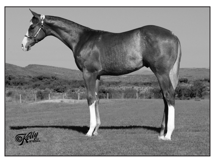
The First Gift is the first colt sired by The Gift Of Midas.

RC Cruise Control, a 2001 loud sorrel overo mare, was sired by the late, great Red Charisma. She is a large, powerful 16 hand mare.