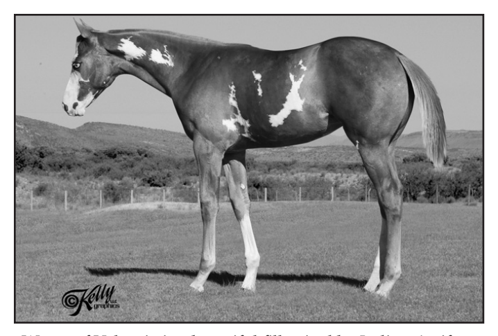
Waves of Valencia is a beautiful filly sired by Indian Artifacts and out of World Champion Mare, Valencia Sol.