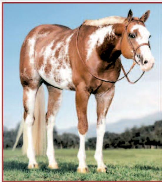
I GOT CHARISMA Chestnut Overo Stallion (1997 – 2012)